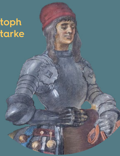
(5) Christoph der Starke

He wears his battle armour and carries his lion-crested tournament helmet on his saddle. He wears a red cap on his proudly raised head, the colour of which pleasingly corresponds with the trapper on his horse.