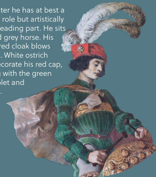
(7) Ducal herald

As a character he has at best a supporting role but artistically he plays a leading part. He sits on dappled grey horse. His light coloured cloak blows in the wind. White ostrich feathers decorate his red cap, contrasting with the green of his doublet and saddle pad.